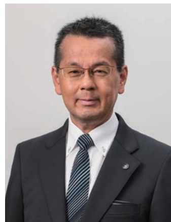
President & CEO

We are determined to resolve such challenging issues with parties concerned and contribute to the world as well as Japan.